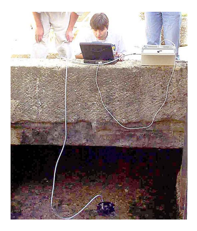
Figure 3 - Field fluorometer set-up in a stream

visit is required, as well as sample analyses in the lab. The result of the test is directly available in the field, with equivalent sensitivity. Moreover, the capability of detecting 3 tracers at a time allows for sophisticated injection-detection strategies.